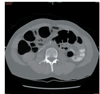
Electronically cleanses residual stool