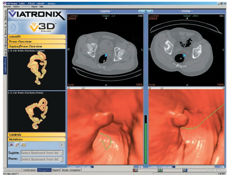
Supine-prone registration exclusively with V3D-Colon

The study concluded that effective time-efficient primary 3D evaluation appears to be feasible only with the Viatronix system.