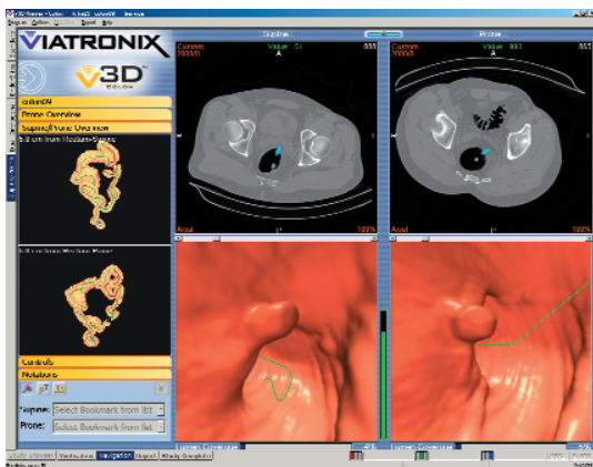
Supine-prone registration exclusively with V3D-Colon

That's because only Viatronix V3D-Colon provided physicians with the features, tools and visualization capabilities they required to complete this comprehensive study.